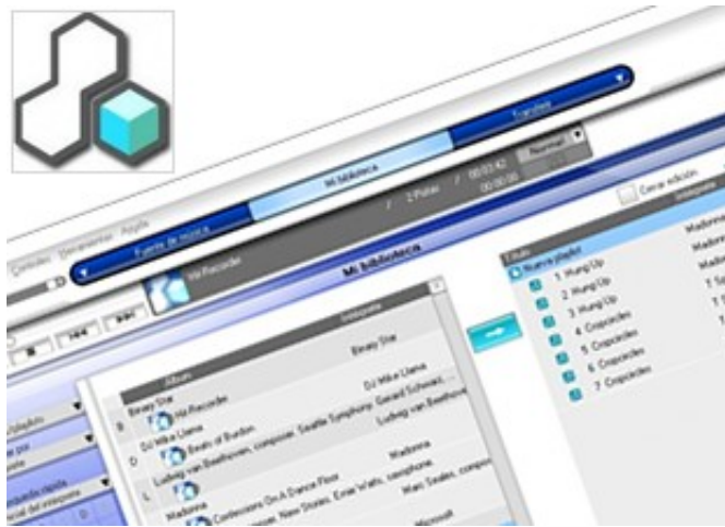
SonicStage 4.3 Full US